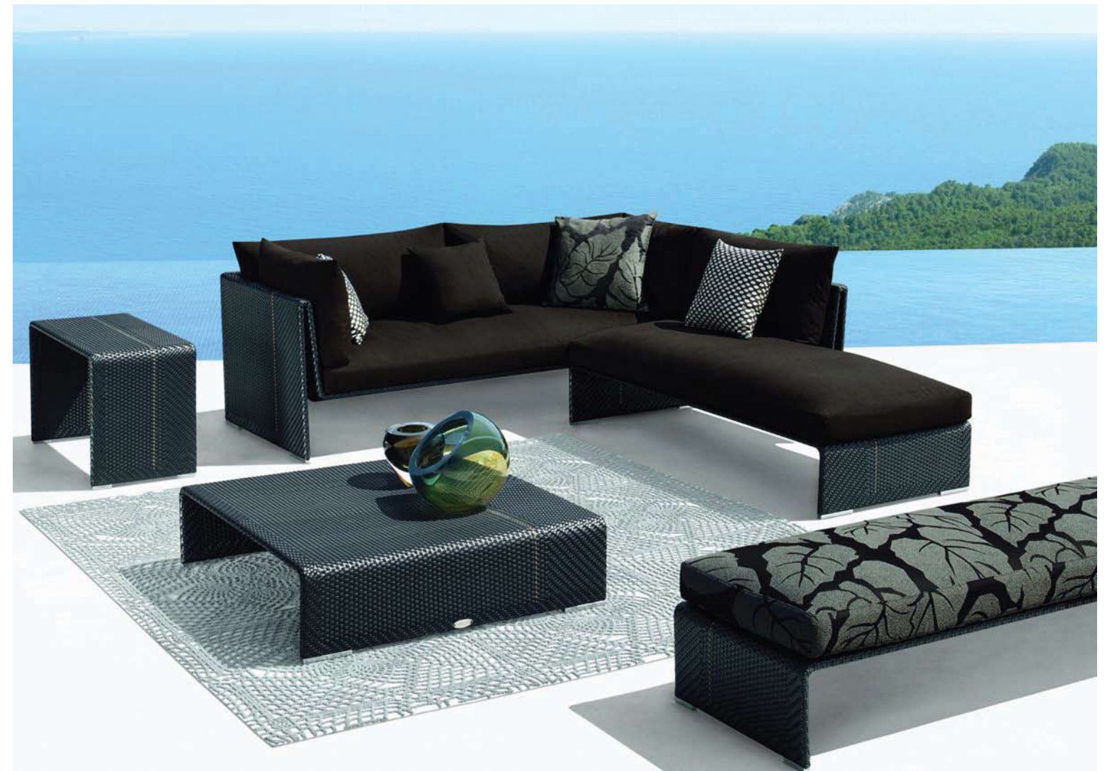
JANUS et Cie, Suite 1876, Merchandise Mart

Outdoor furniture should be to scale with your exterior space, with comfort as a prime consideration. When designing your outdoor area, consider Louis Sullivan's advice that form follows function. Outdoor furniture should reflect your lifestyle, as well as your personal taste. Fortunately, today's fabrics for outdoor use are not only beautiful, but practically weatherproof, so expect them to last for years.