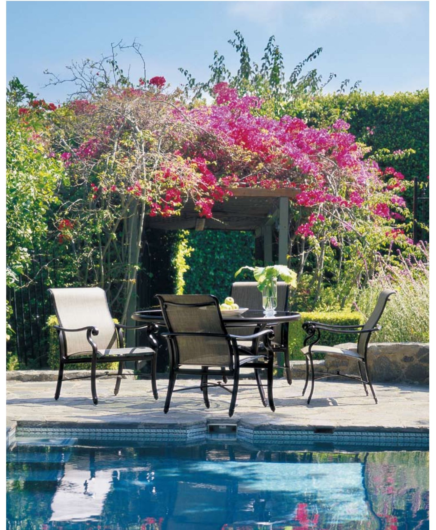
Camden Square sling in Java finish with River Rock mesh.